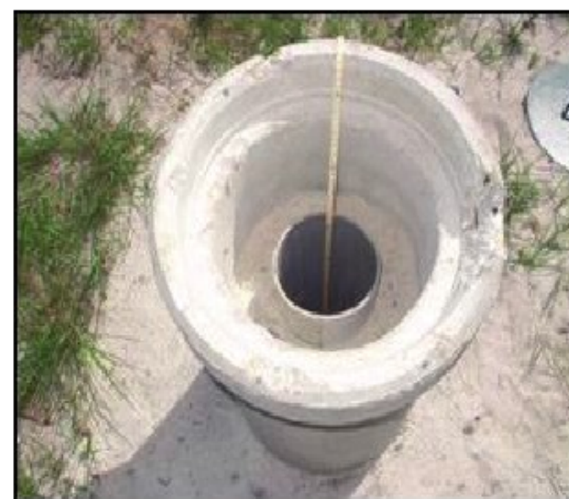
Exemple de piézomètre où la mesure du niveau piézométrique est faite à l'aide d'une sonde manuelle

Permet de connaître la profondeur du niveau de la nappe phréatique dans les sols au voisinage de l'ouvrage, mais aussi dans les barrages en terre, digues, etc.